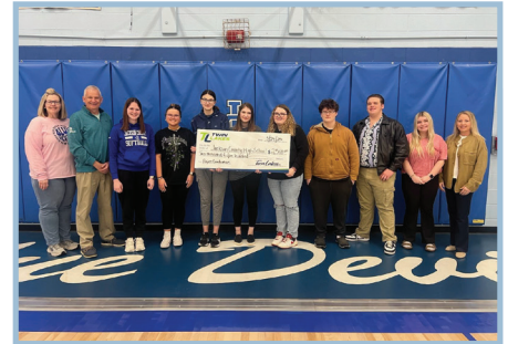
Jackson County High School