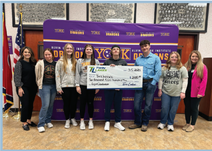
Alvin C. York Institute