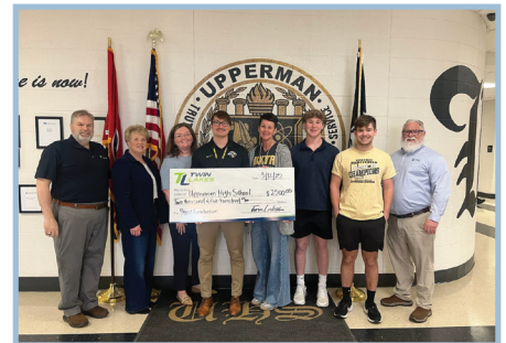
Upperman High School