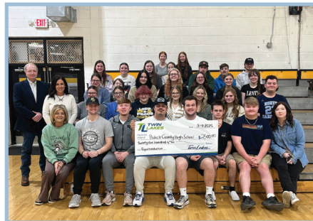
Pickett County High School