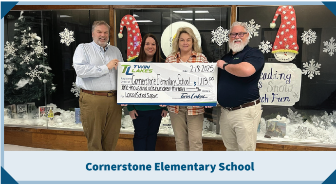
Cornerstone Elementary School