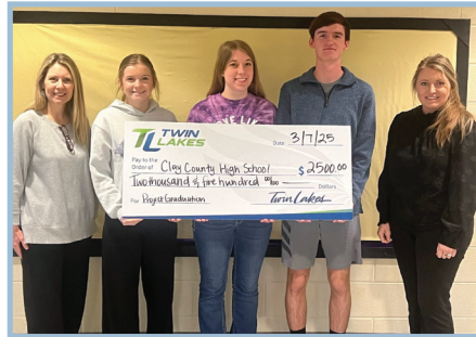
Clay County High School